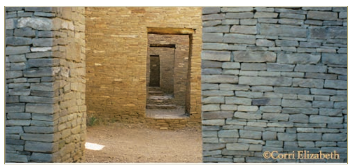
Doors Opening Chaco Canyon, NM, 2001

as excerpted from letters by former interns to Pen Project Prison Writers followed by the application